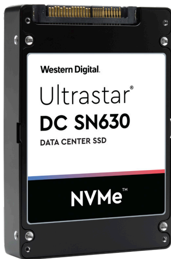
Ultrastar DC SN630 NVMe SSD

The Ultrastar DC SN630 is an enterprise class NVMe SSD optimized for balanced price and performance cloud storage. NVMe was developed to connect high performance flash memory to compute resources over native PCIe links. It eliminates the legacy SCSI command stack and direct-attached storage (DAS) bottlenecks associated with traditional