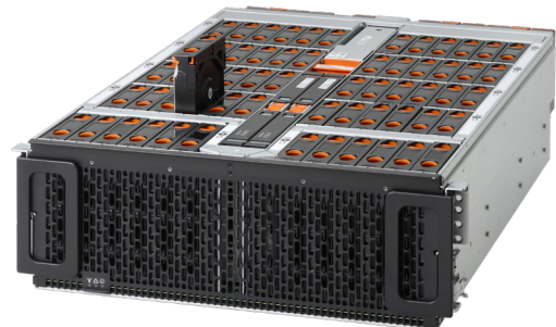
Ultrastar Data102 and Ultrastar Data60 Storage Platforms