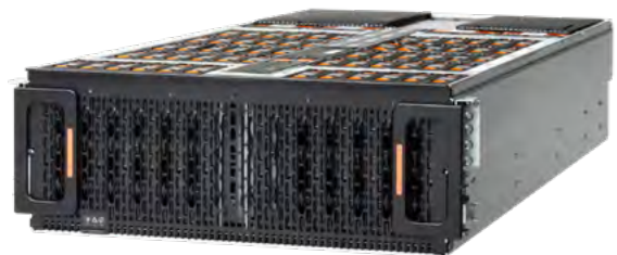
Western Digital's Ultrastar Serv60+8 Hybrid Storage Server