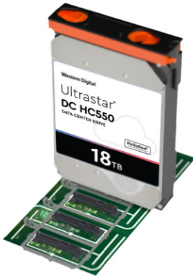
Figure 3. Precise cuts in the baseboard for vibration reduction

IsoVibe is a collection of Western Digital patented design innovations. Precise cuts in the baseboard act as a suspension for the drives providing isolation from the vibration transmitted from one drive to another. Vibration-isolated fans also minimize acoustic vibration, suppress noise transmission and reduce the amount of transmitted interference.