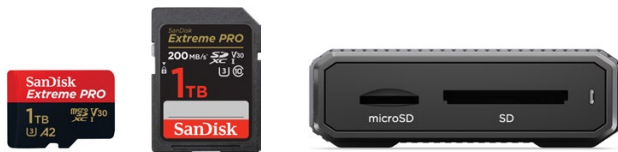
Cards and readers sold separately.

SanDisk® QuickFlow™ Technology is a workflow solution for professional photographers and content creators who want to maximize their shoot time. They can get back in the field faster with the latest SD and microSD™ UHS-I card 1 offload speeds from SanDisk. The faster speeds, and time savings they deliver, are achieved when SanDisk Extreme®, Extreme PLUS and Extreme PRO® UHS-I cards are paired with SanDisk® Professional PRO-READER SD and microSD.