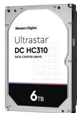
Ultrastar® DC HC310 (7K6)

Hard drive random-write performance is limited because you need to physically move the drive head to the track being written, which can take several milliseconds. Western Digital's media cache architecture is a disk-based caching technology that provides large non-volatile cache areas on the disk. This architecture can improve the random small-block write performance of many Hadoop workloads by providing up to three times the random write IOPS. Unlike a volatile and unsafe RAM-based cache, the media cache architecture is completely persistent and improves reliability and data integrity during unexpected power losses. No Hadoop software changes are required to take advantage of this optimization, which is present on all 512e (512-byte emulated) and 4Kn (4K native) versions of the drives in this paper.