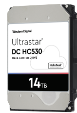
Ultrastar DC HC530