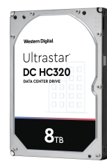
Ultrastar DC HC320